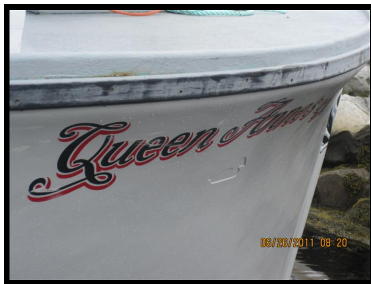
Queen Anne Boat