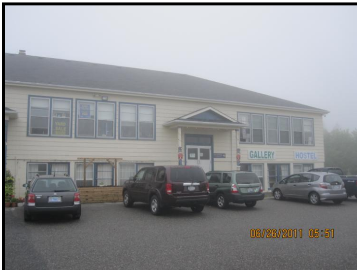
Coffee Reception at the Hostel. Met community leaders, local entrepreneurs and resource people.

Port Mouton Bay, Nova Scotia Sunday June 26