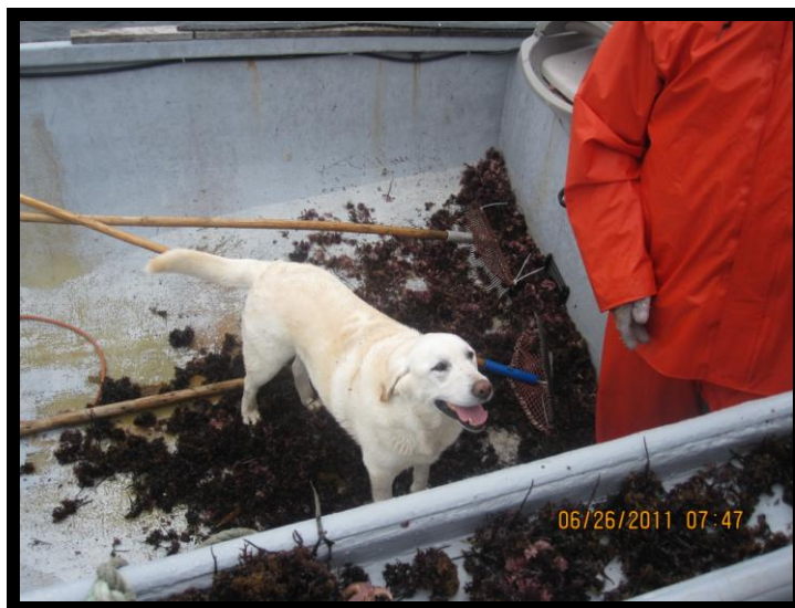
When boat is filled with 3000 lbs sold for $.19/lb or $ 570 for a day's trip but lots of work