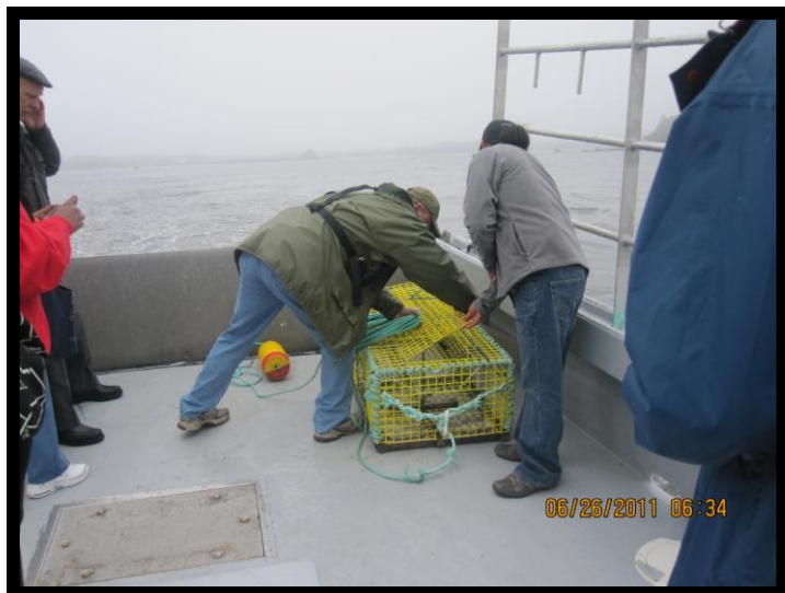
Getting lobster cage ready to be thrown over the boat