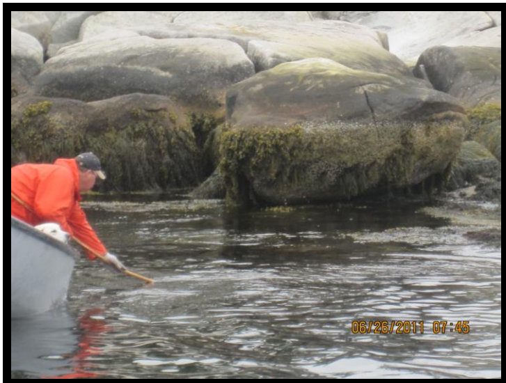
Man netting moss that grows on the island rocks