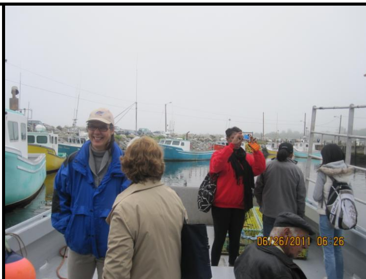
Guests waiting to choose a boat trip