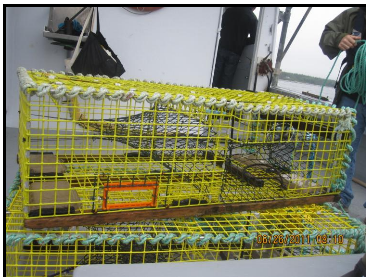
How it looks like inside the cage