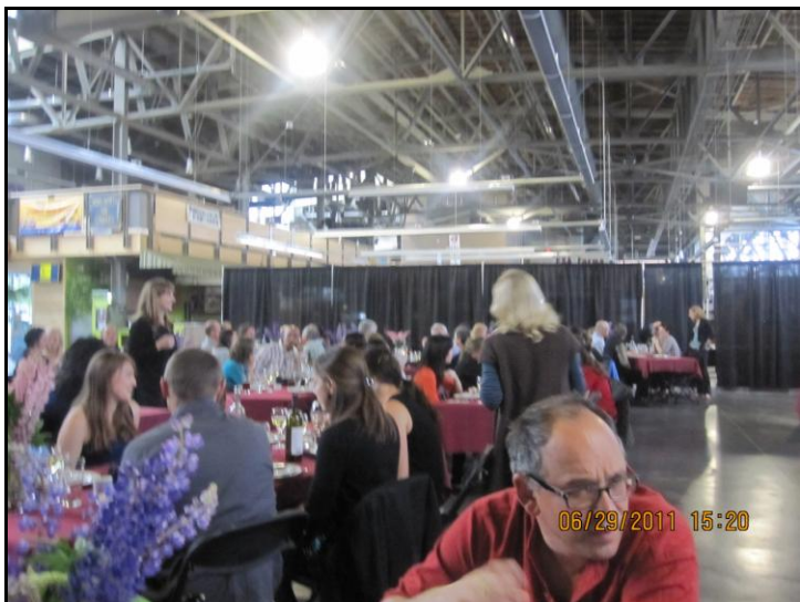
Photo of the conference Banquet