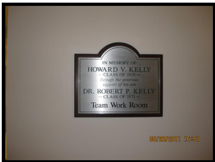
Some sample sponsored plaque to recognize a donor