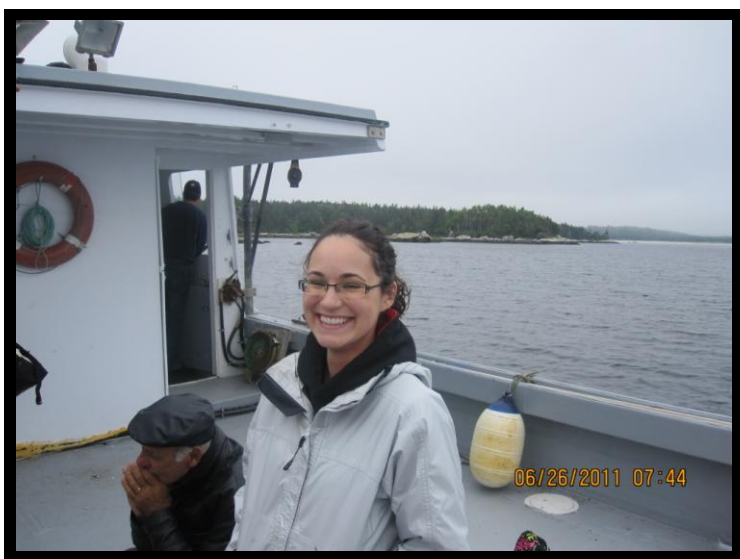
Queen Anne the boat was named after her