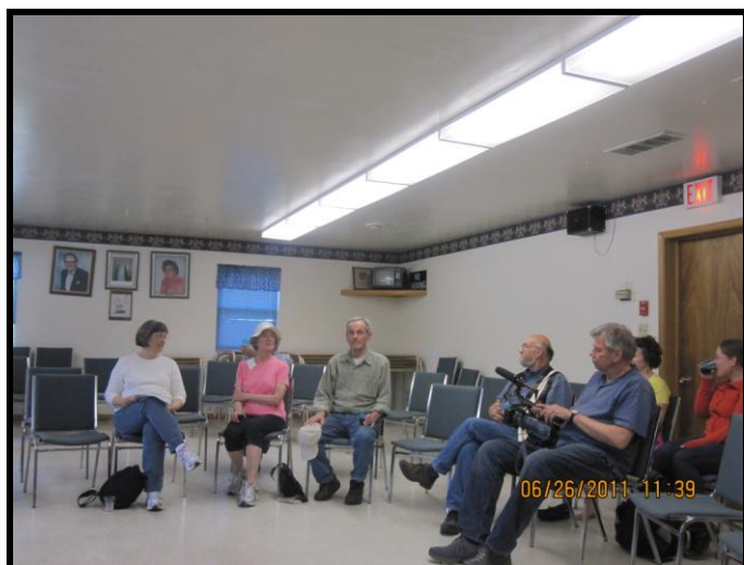
Wrap-up at West Queens Recreation Center