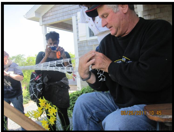
Using the old way to make his own net