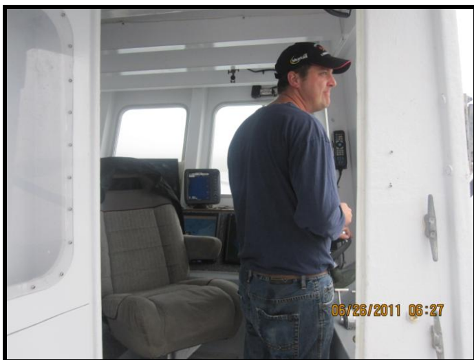
Boat trips depart from Central Port Mouton wharf