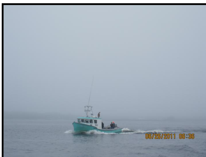
one of the boats used on the tours