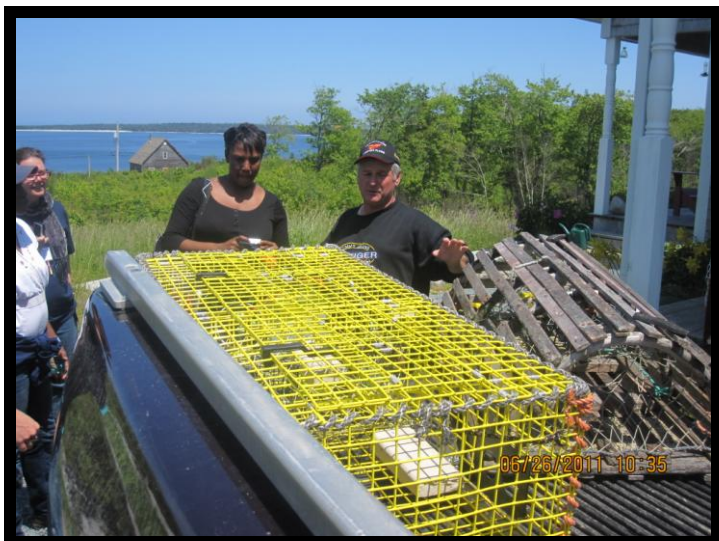
How the old nets (on the right) looked like