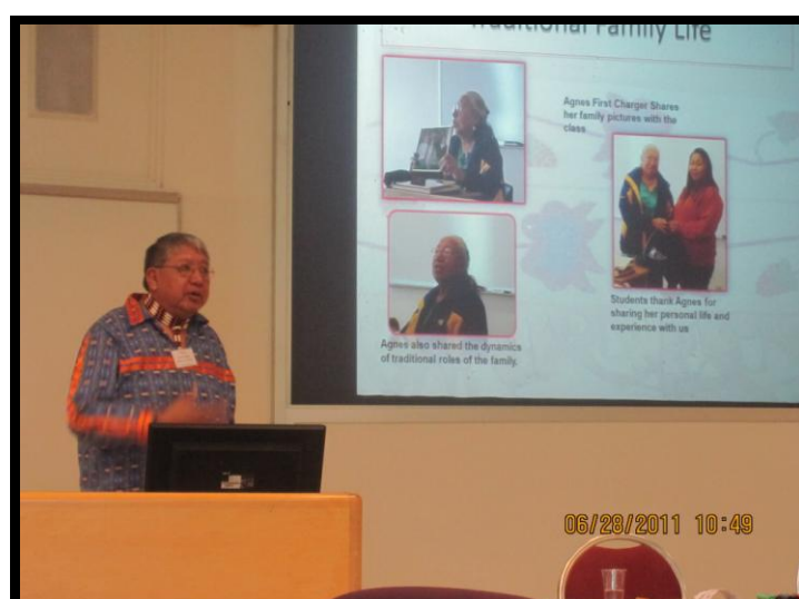
Topic was “Using Elders in the Educational Institution”