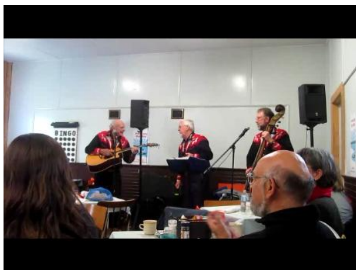
Band playing at the Lobster Chowder Lunch in Southwest Port Mouton