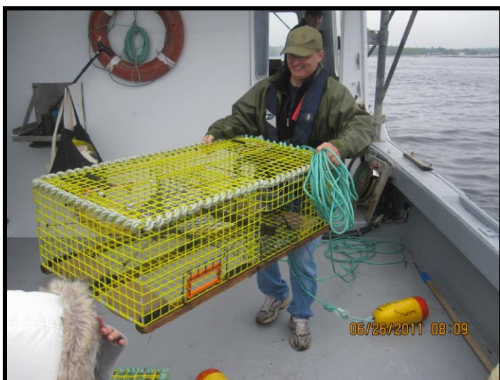
Taking lobster net out of the water but no lobster