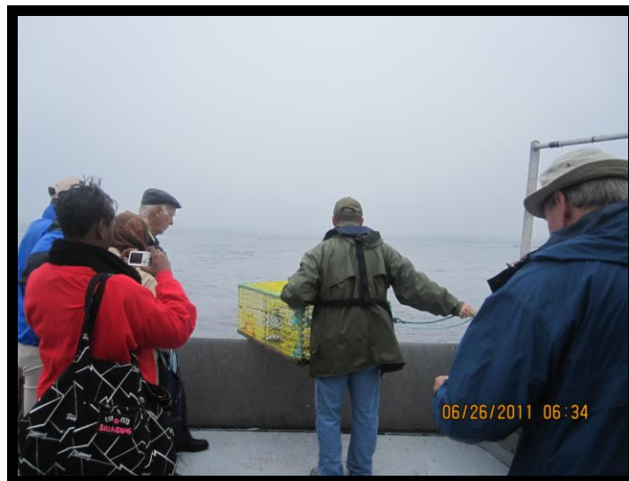
Cage being thrown into the water buit no bait due to off season fishing