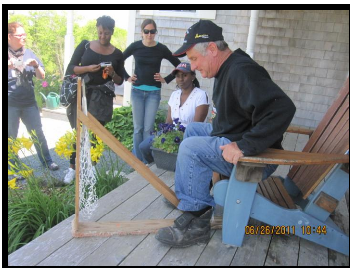
Man getting ready to weave his own net