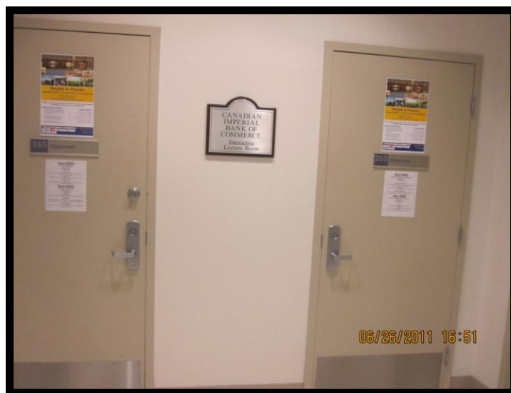
A sponsor named after one of the rooms