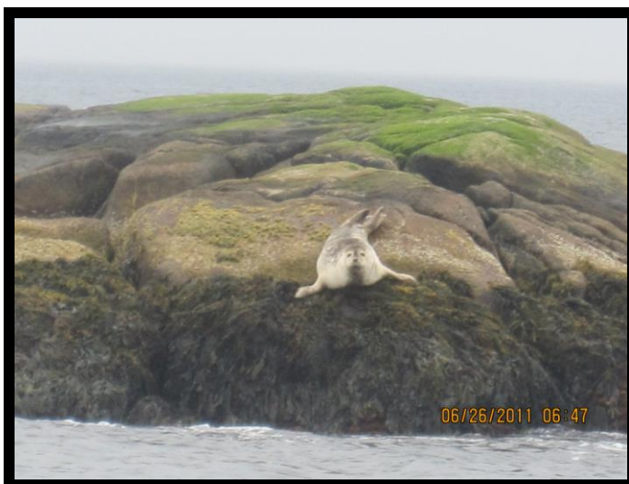
Seal on one of the islands